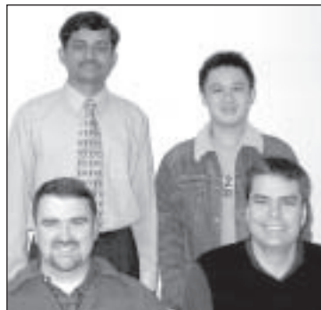
SDA/NBB Glycerine Innovation Award Winners

This award was established to recognize outstanding achievement for research into new applications for glycerine with particular emphasis on commercial viability. The award is sponsored by The Soap and Detergent Association and the National Biodiesel Board, offered through the Industrial Oil Products Division, and consists of a $5,000 honorarium and a plaque.